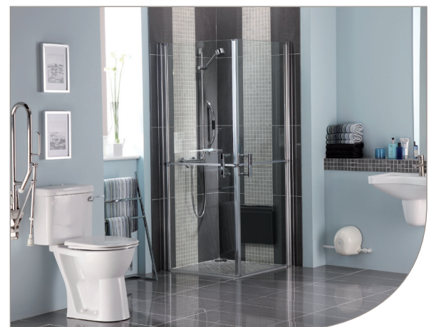
Larenco Duo Option