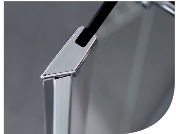
6mm Clear Toughened Safety Glass